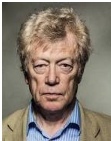
Philosopher Roger Scruton

Besides its clear health giving qualities there are other important human issues that centre on singing. Singing in groups is an important human activity with all sorts of benefits says the distinguished philosopher, Roger Scruton . Speaking on a recent BBC Radio 4 programme about choirs, he said: “Choral singing is one of the things that defines Europe from the rest of the world. It is unique to Europe. It’s not about ethnicity or tribalism but it is about nationality, about this place.”