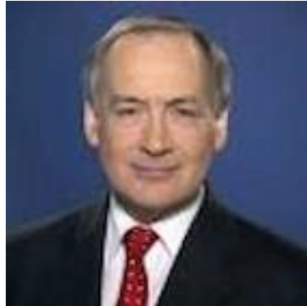
Alistair Stewart ITV

ITV news anchor, Alastair Stewart OBE , says of the Choir: “The Bach Choir is simply magnificent: constantly attracting new talent and always displaying the beautiful merit of music for practitioners and audiences. One of the finest”.